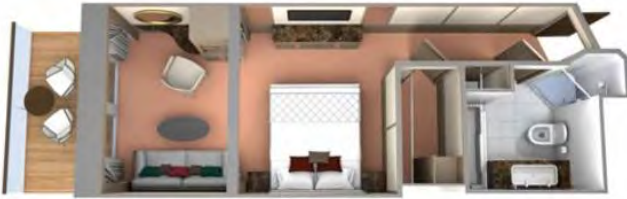
Veranda Suites (V1, V2, V3, V4) 355 sq/ft