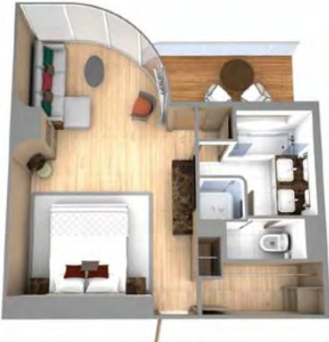
Veranda Panorama Suites 417 sq/ft