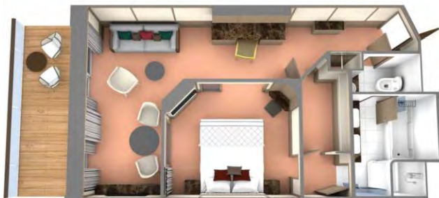
Penthouse Suites 527 sq/ft